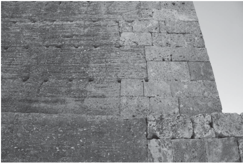
Figure 3. NW wall of the tower (A. Graciani).

Three building characteristics of the rammed-earth wall masonry make it unquestionably Almohad, and even more specifically as from the early 13th century: the use of flat horizontal timbers, continuous rammed-earth walls, and chained stone masonry. These features make their first appearance with the Almohads and show considerable care in their execution and the use of the best materials (Fig. 3). The use of chained stone masonry on the corners, not recorded in Seville until the start of the 13th century in towers (such as the Tower of Gold in Seville), also constrains the building of the Tower of Don Fadrique to this period.