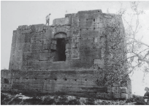
Figure 2. Image from the 1930s.