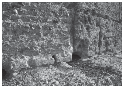
Figure 4. NW face of the tower (detail) (A. Graciani).

However, there is a certain trend to higher hazard in material damage (erosion), evidenced by a somewhat higher hazard level due to the lack of protec-