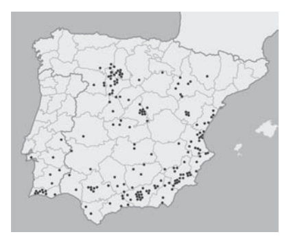
Figure 1. Location of the buildings catalogued up to date and introduced in the data base.

On the other hand, using the database previously created, a first selection of interesting cases was drawn up, which may increase in the future depending on the interest that may be aroused by the new cases introduced in the database. The selection of the first approximately 50 cases was based on: the interest of the building, the interest and importance of the restoration works, the variety of building techniques used, the presence of different interventions carried out at different times, etc. For the buildings selected, a detailed file was drawn up to contain the information necessary to analyse the intervention criteria and techniques and the results of these. The files were drawn up by the architects,